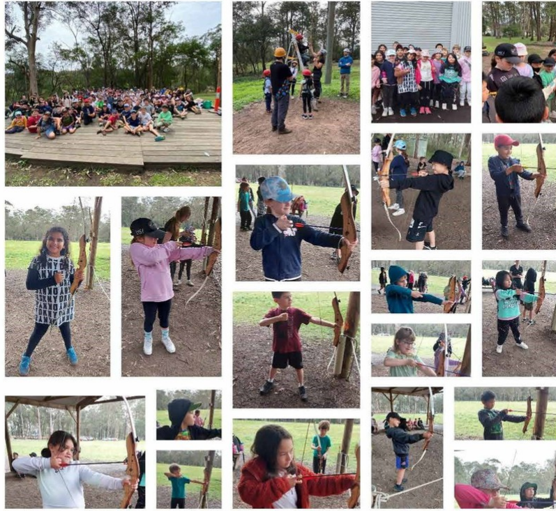
Year 6 Mini-Fair