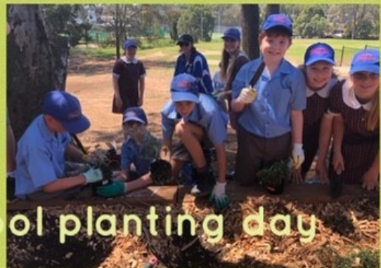
Our whole school planting day