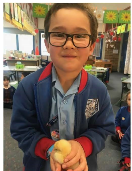
Living Eggs Program.