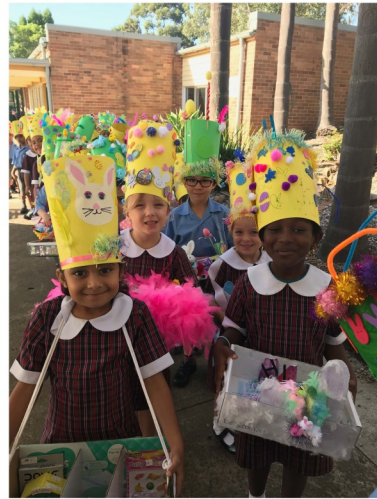
Proudly parading our Easter hats made with our Year 6 buddies.