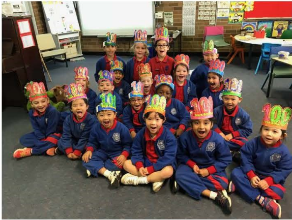
Celebrating 100 days of learning in KL